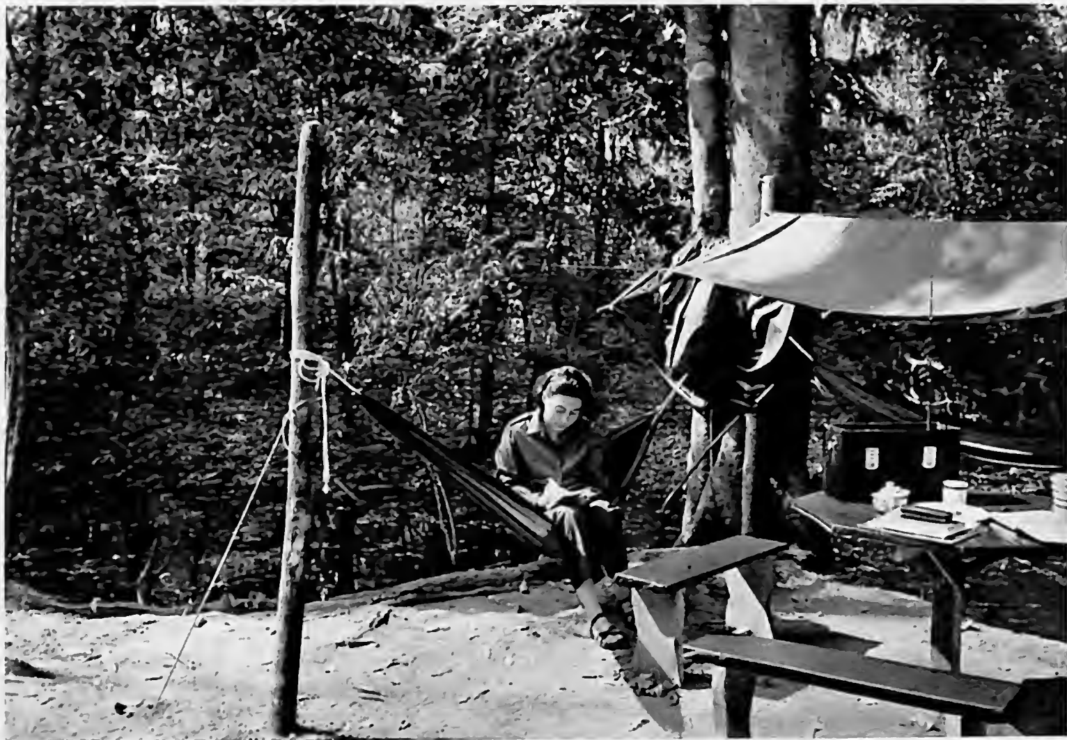
Madame Sihanouk writes in her diary.